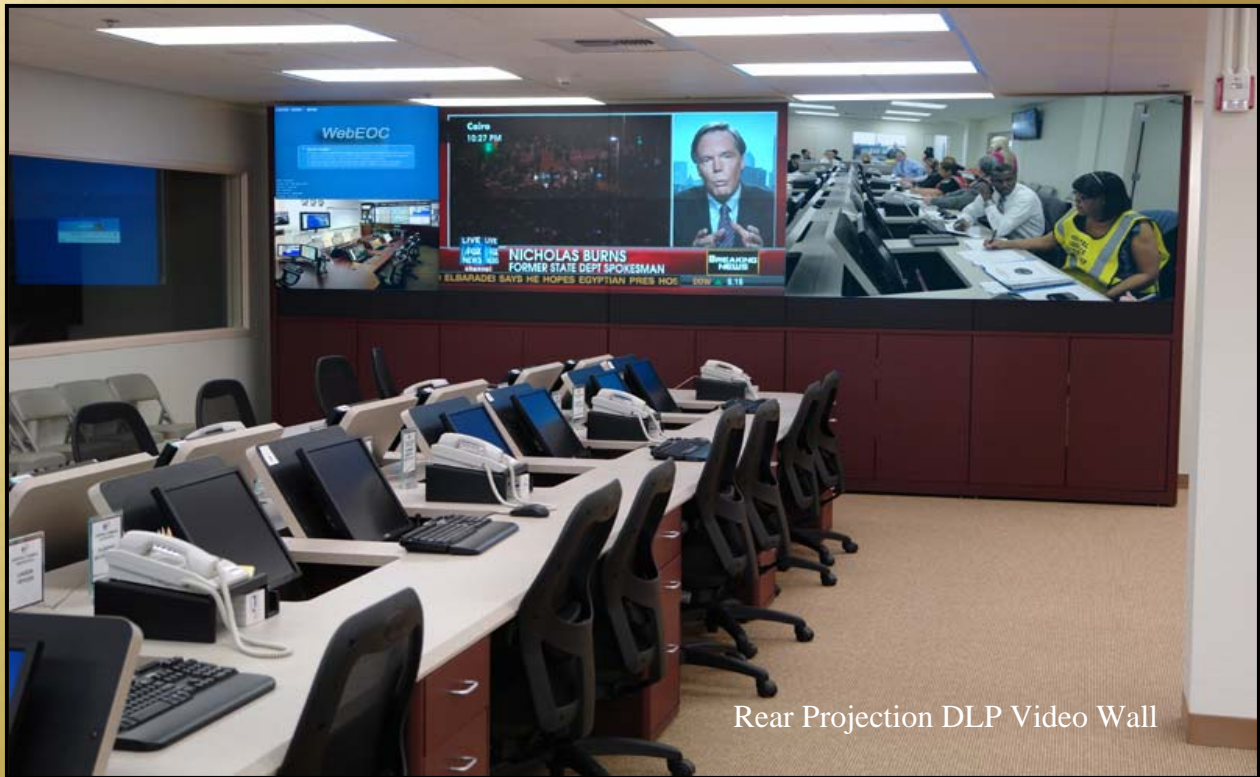
Rear Projection DLP Video Wall

Visionmaster is Americon's all-inclusive video wall solution. It includes an array of monitors, a video wall processor that turns the array into a single palette and video wall cabinetry for mounting the monitors and storing electronic peripherals.