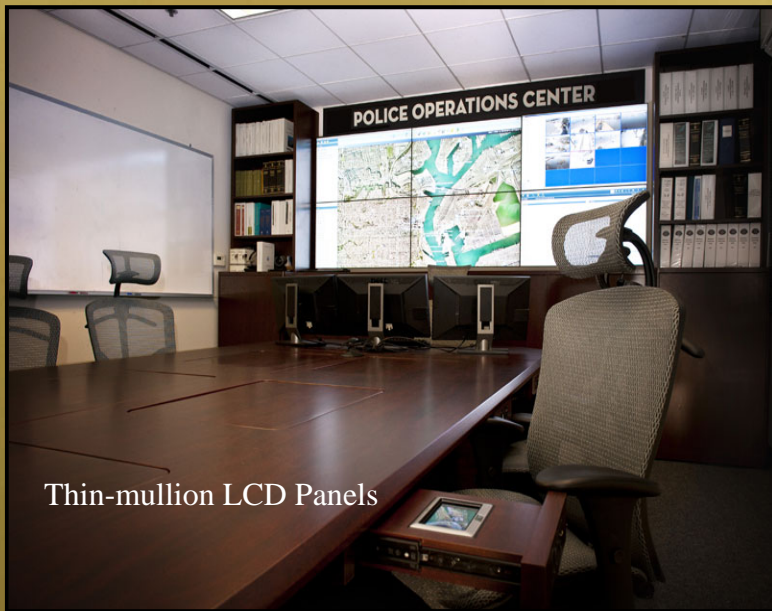
Thin-mullion LCD Panels

Visionmaster is Americon's all-inclusive video wall solution. It includes an array of monitors, a video wall processor that turns the array into a single palette and video wall cabinetry for mounting the monitors and storing electronic peripherals.